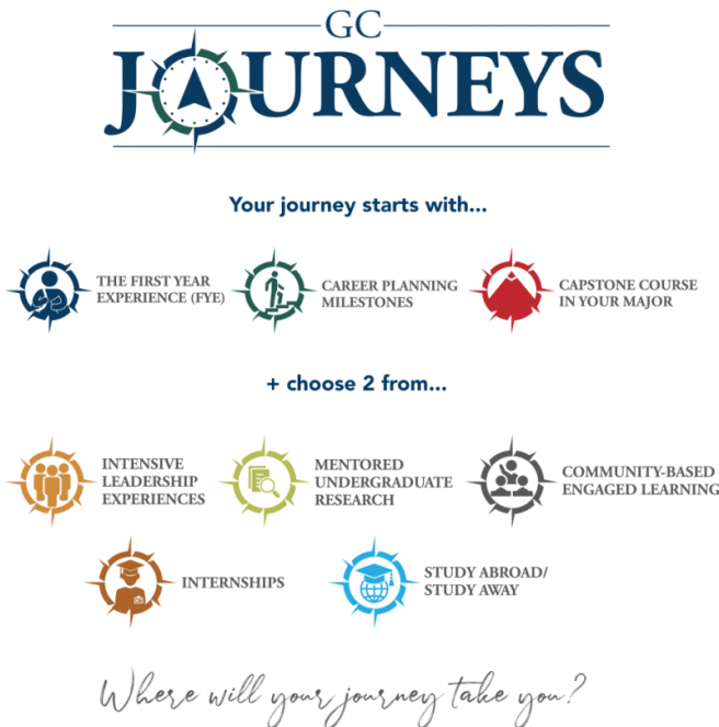
Figure 2: GC Journeys infographic ( https://www.gcsu.edu/gcjournneys ).

While five HIPs seemed ambitious, departments embedded as many HIPs into the degree program as possible. Ultimately, three HIPs were chosen to be embedded in each student’s degree program and students would choose two more. As part of GC Journeys, all students—regardless of major—will complete a first year experience, a capstone course in their major, and finally an institutionally developed option called “Career Milestones.”